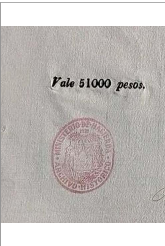
Image: Detail of the Seal